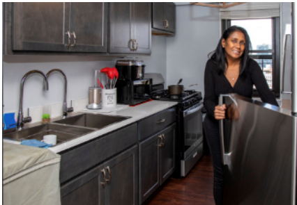
New Kitchen at Independence