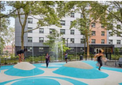
New Splash Pad at Baychester