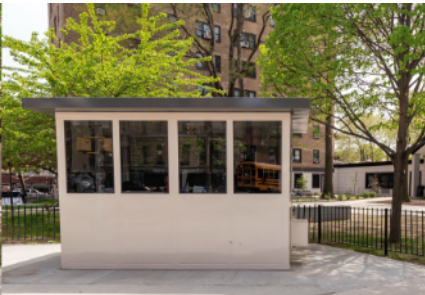
New Security Booth at Independence